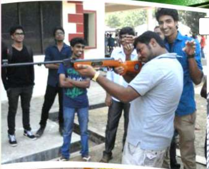
Art Fest 2014