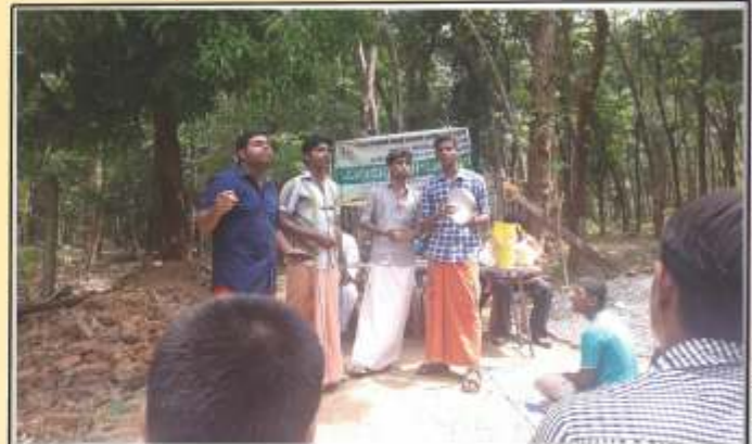
Entertainment activities held at Kalchadi Palakkad under the banner of NSS