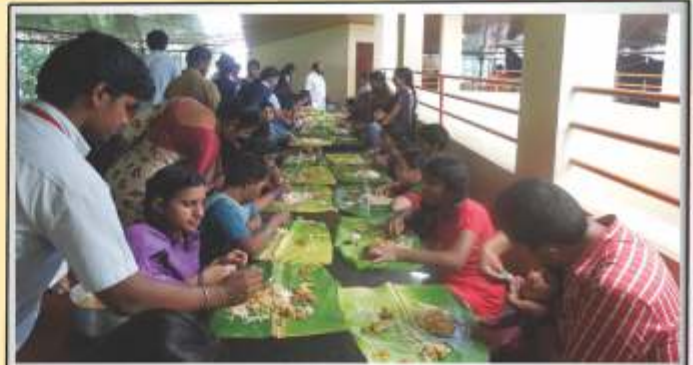
Onam celebration at Reach Swasrya Kuttoor