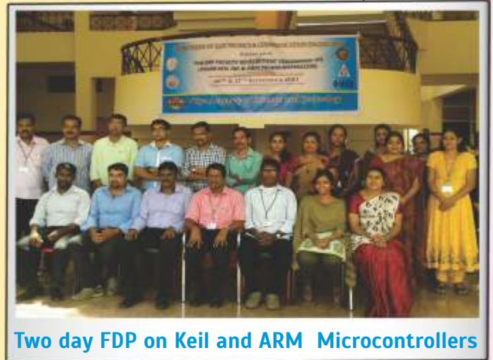
Two day FDP on Keil and ARM Microcontrollers

The Department of ECE conducted a two day FDP on Keil and ARM Microcontrollers on 26 th and 27 th of September 2014.