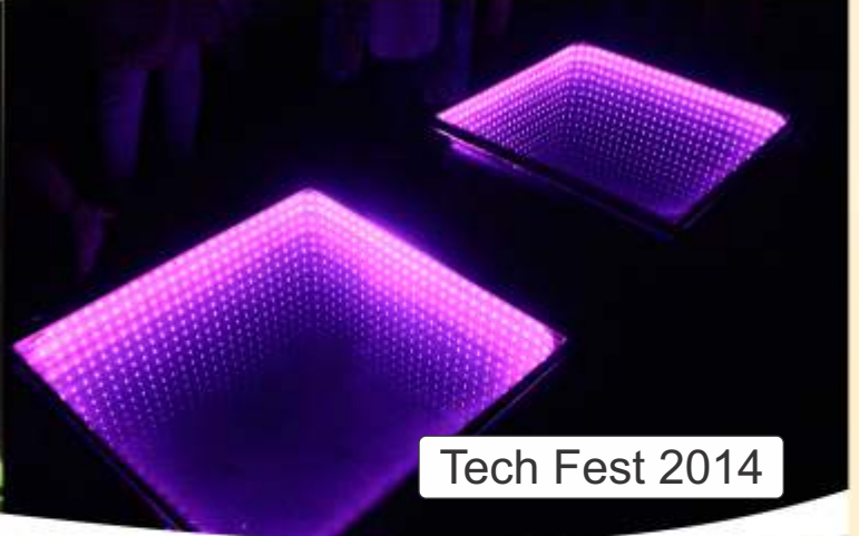
Tech Fest 2014