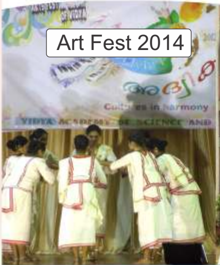
Art Fest 2014