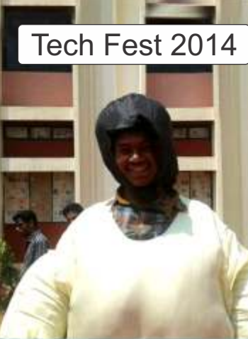
Tech Fest 2014