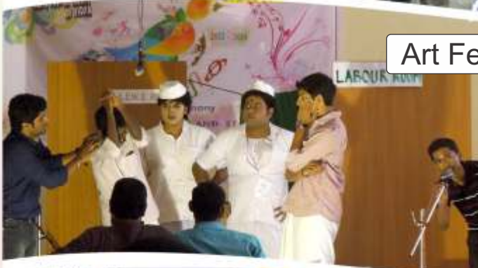
Art Fest 2014