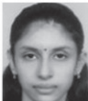
VIDYA.B EEE (2003-07)