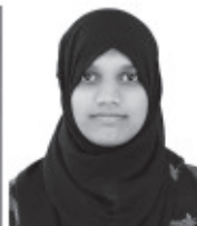
SHALIYA.P.S ECE (2011-15)