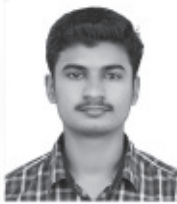
SUSOBH ME (2011-15)