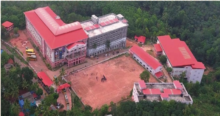
VIDYA ACADEMY OF SCIENCE AND TECHNOLOGY TECHNICAL CAMPUS, KILIMANOOR