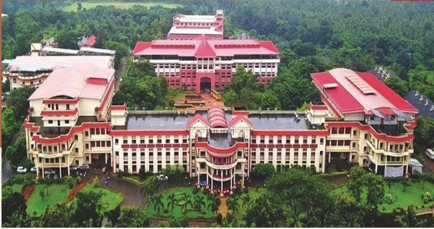
VIDYA ACADEMY OF SCIENCE AND TECHNOLOGY, THRISSUR