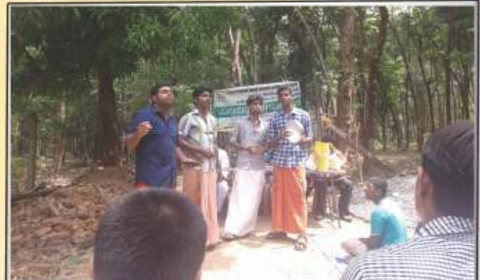
Entertainment activities held at Kalchadi Palakkad under the banner of NSS