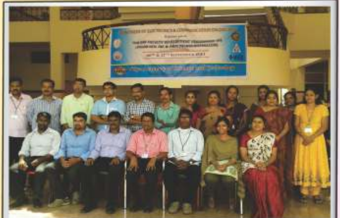
Two day FDP on Keil and ARM Microcontrollers

The Department of ECE conducted a two day FDP on Keil and ARM Microcontrollers on 26 th and 27 th of September 2014.