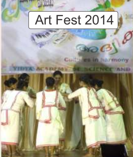
Art Fest 2014