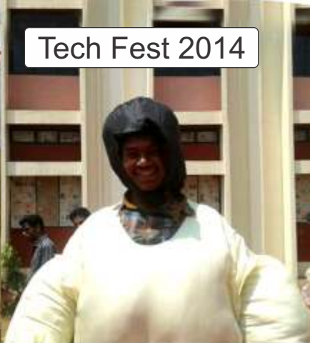
Tech Fest 2014