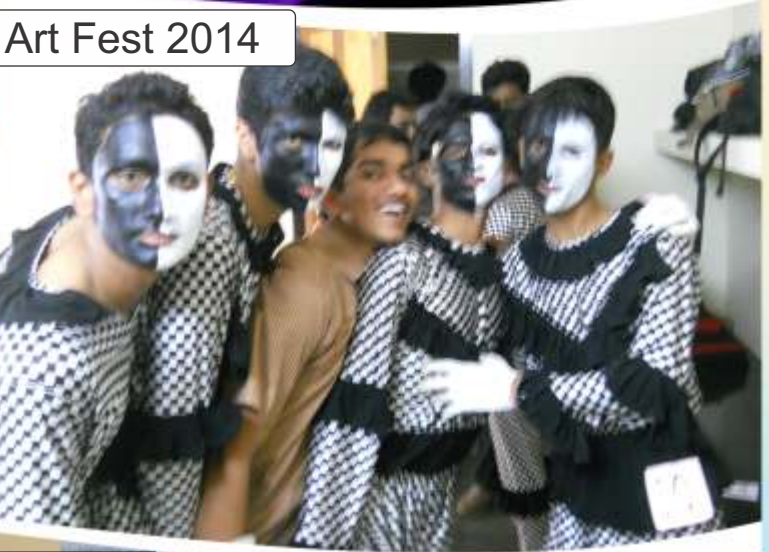
Art Fest 2014