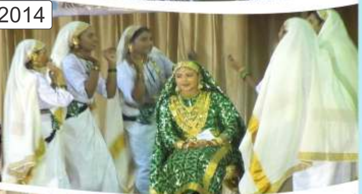
Art Fest 2014