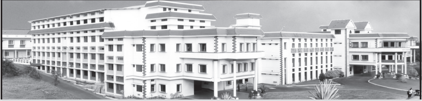
Visit our website www.vidyaacademy.ac.in for ONLINE application

B.Tech: 8281 79 5555 | M.Tech: 8281 59 5555 | MCA: 8281 39 5555