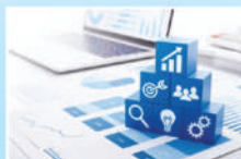
Financial Sustainability and Operational Excellence