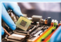
Industry, Research & Professional Practice